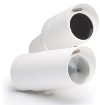
Additional Detector Pack