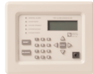
5860 Remote Annunciator