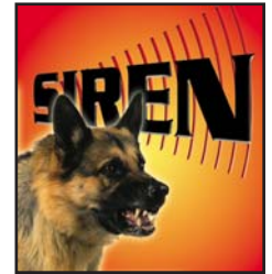
Alert sounds of both the angry watchdog and a warning sign