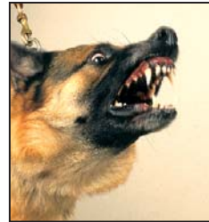
Sound of an angry and protective watchdog