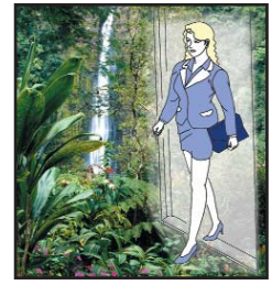
Soothing rainforest sounds to alert you of a guest's arrival