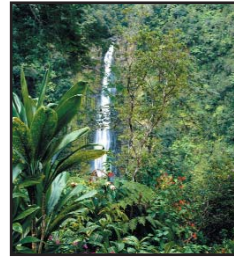
Continual tranquil sounds of the rainforest