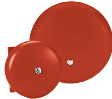
6-INCH and 10-INCH BELLS