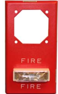
RSSP REMOTE PLATE